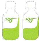
Two bottles of CLENPIQ (5.4 oz each)